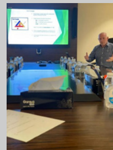
Delivering Fire Training to Head Office Team